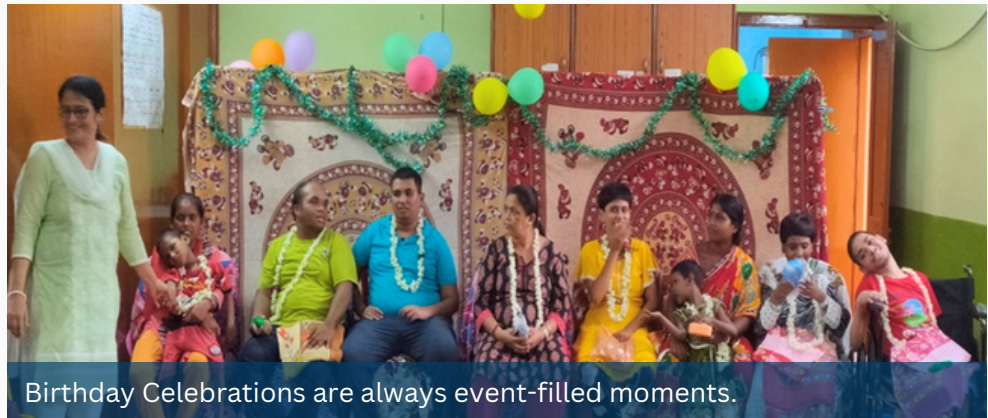
Birthday Celebrations are always event-filled moments.