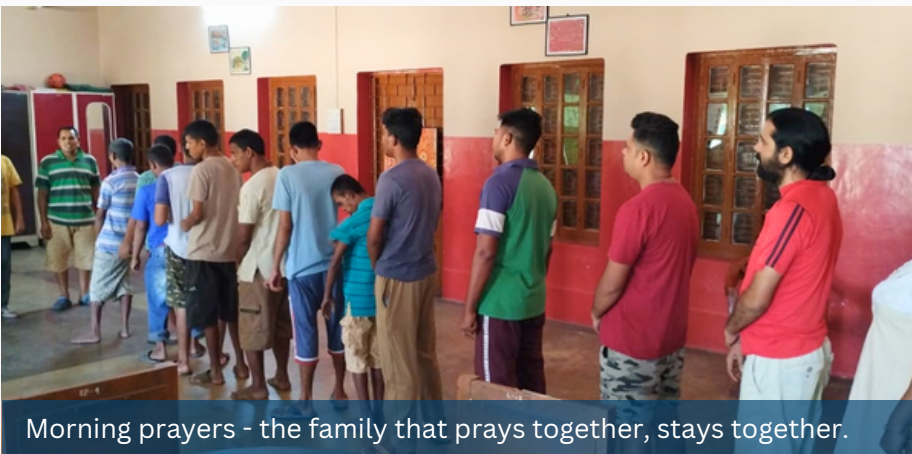
Morning prayers - the family that prays together, stays together.