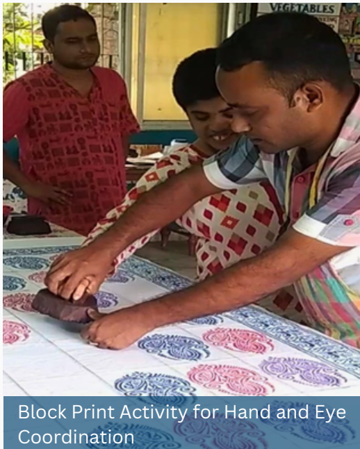
Block Print Activity for Hand and Eye Coordination