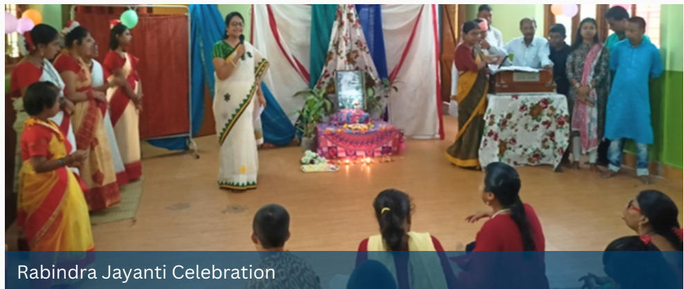
Rabindra Jayanti Celebration