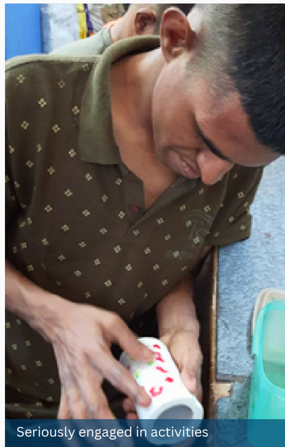
Seriously engaged in activities