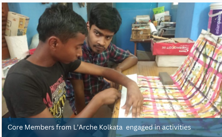
Core Members from L'Arche Kolkata engaged in activities