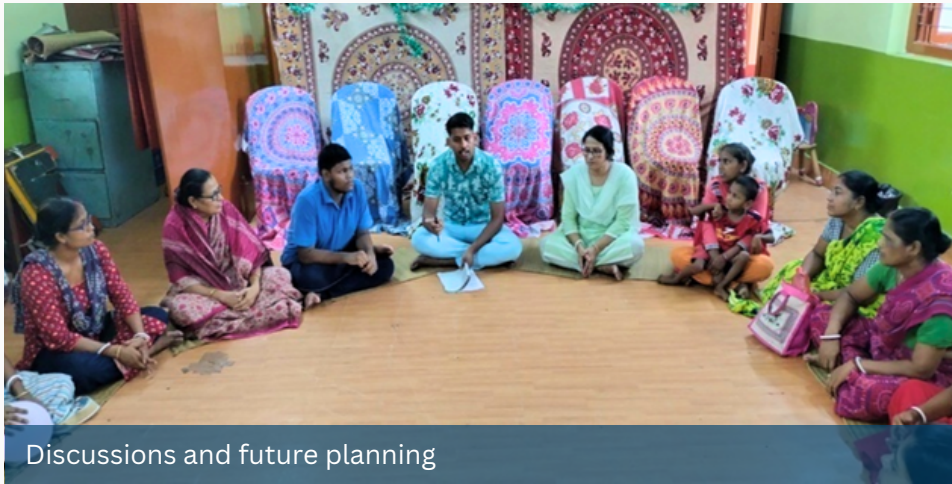
Discussions and future planning