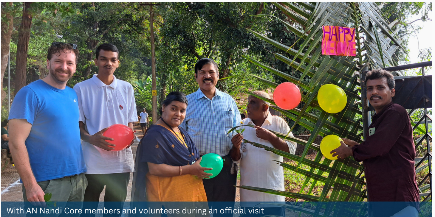
With AN Nandi Core members and volunteers during an official visit