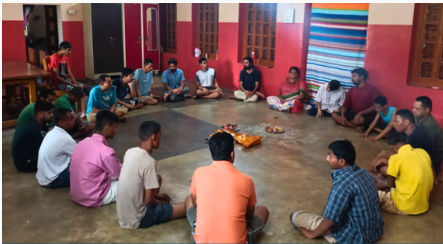
Core Members of L'Arche Asansol engaged in Group Prayer

All the Core members and Assistants are doing well and are in good health. As usual in the house Core members and Assistants are living happily by following house routine.