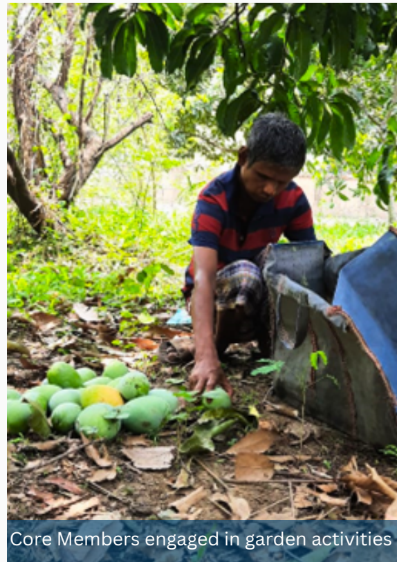
Core Members engaged in garden activities