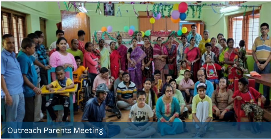
Outreach Parents Meeting