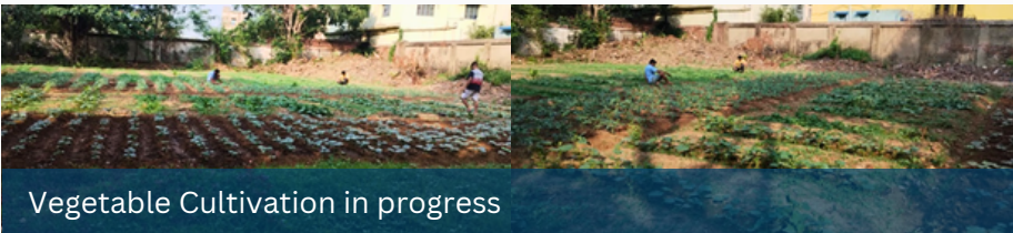
Vegetable Cultivation in progress